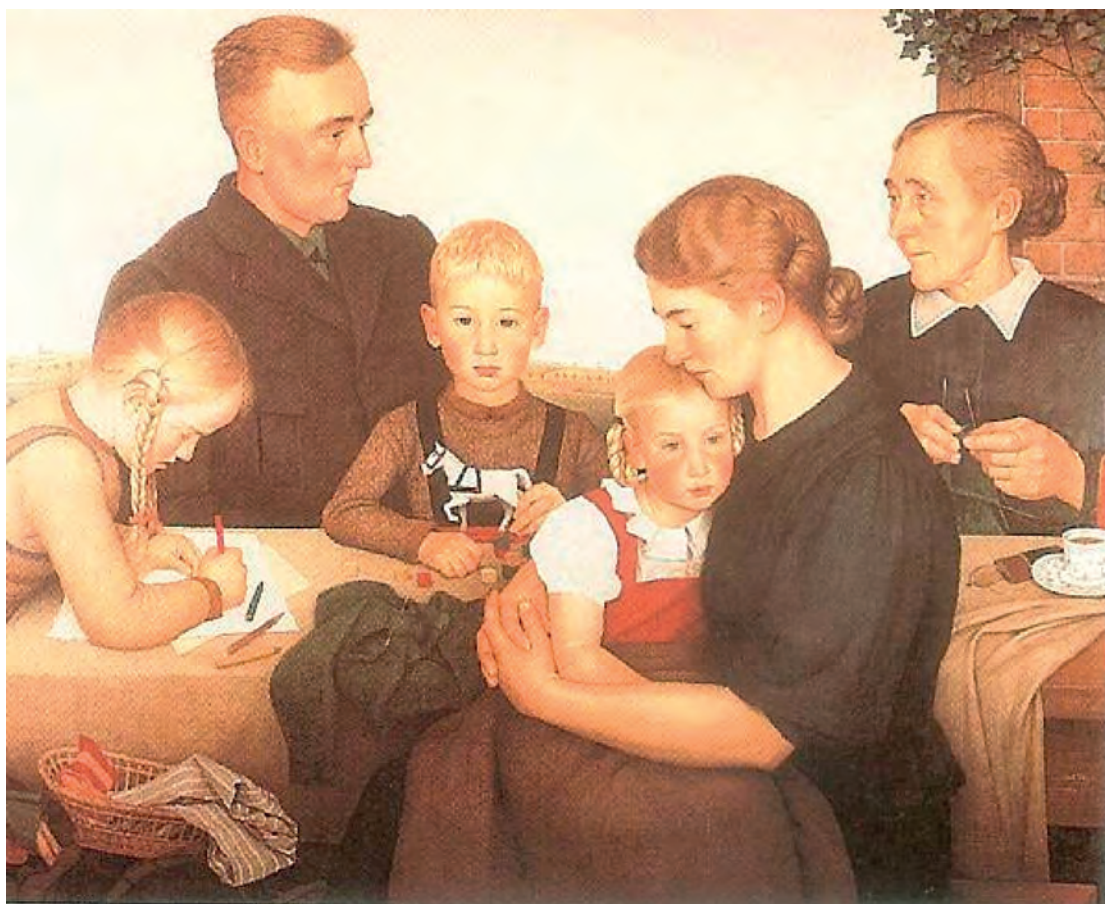
A painting showing a German family, 1939.

10 Look at the painting, and then answer the questions which follow.