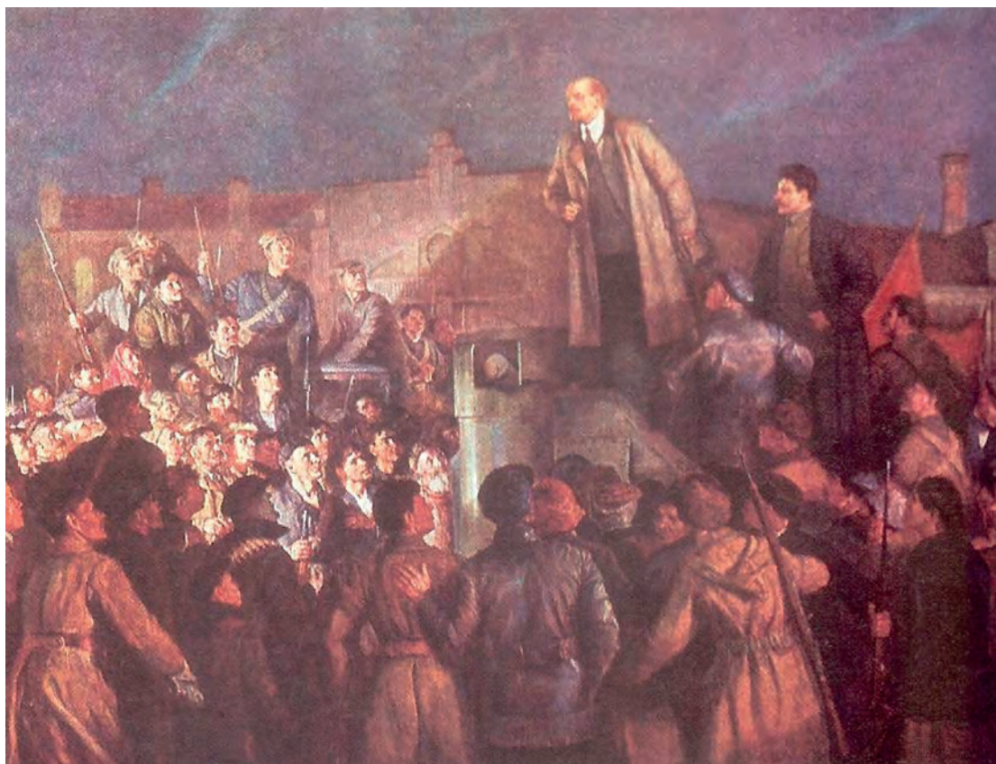
A painting showing Lenin's return to Russia, April 1917.

11 Look at the painting, and then answer the questions which follow.