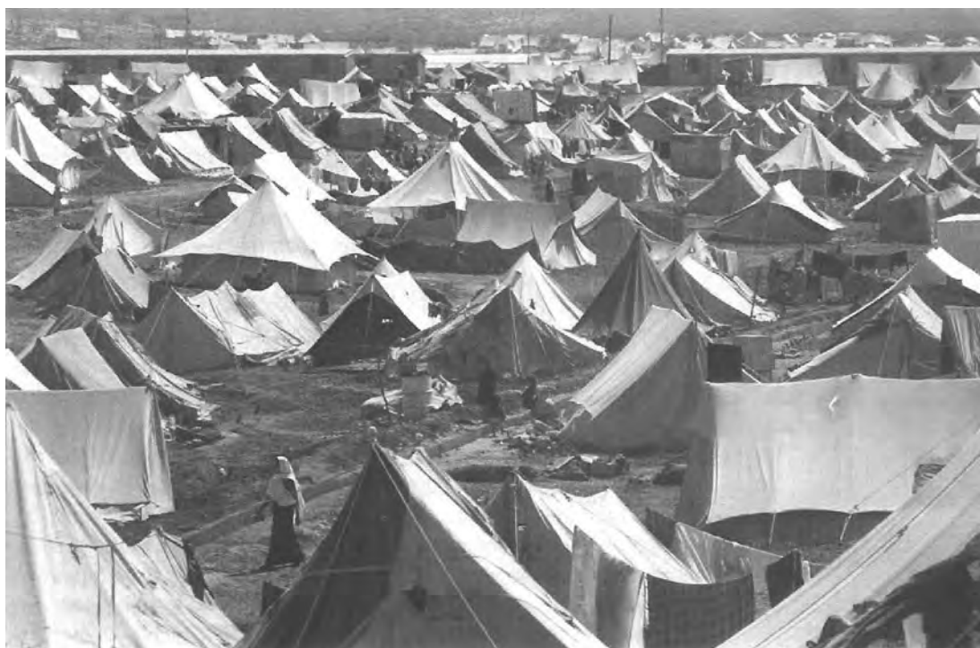
A photograph of a Palestinian refugee camp in Jordan in 1949.

21 Look at the photograph, and then answer the questions which follow.