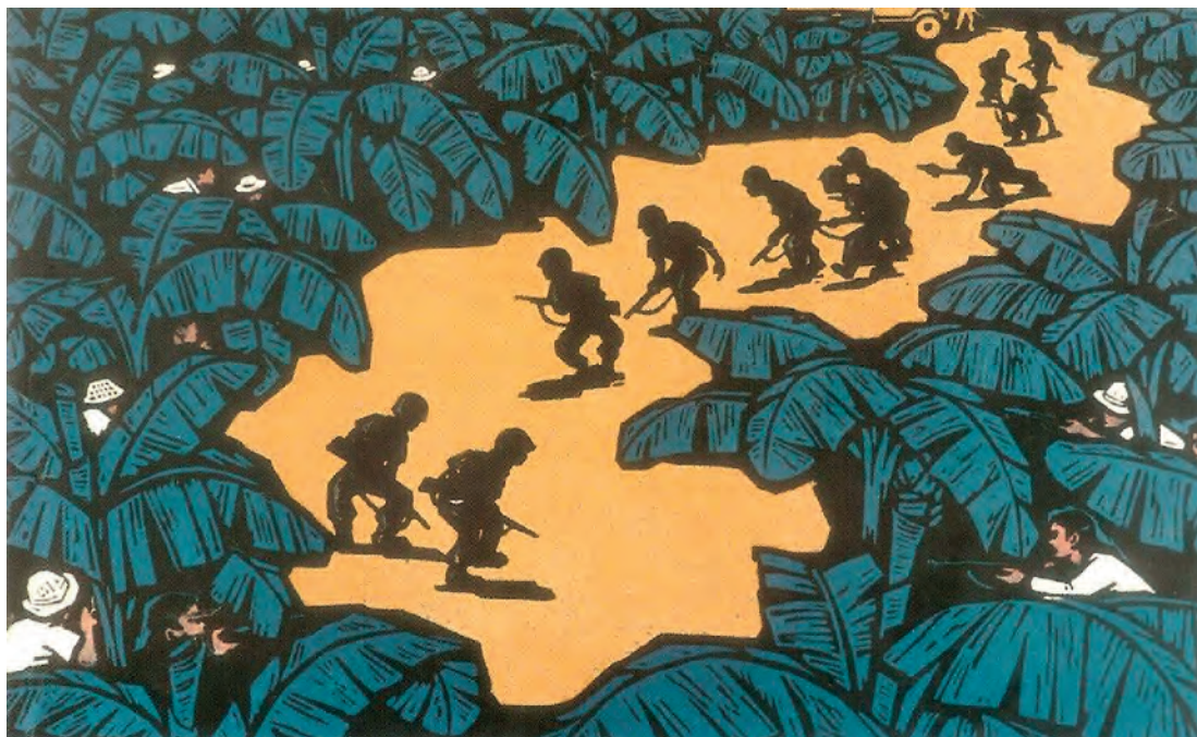
A Vietcong poster.