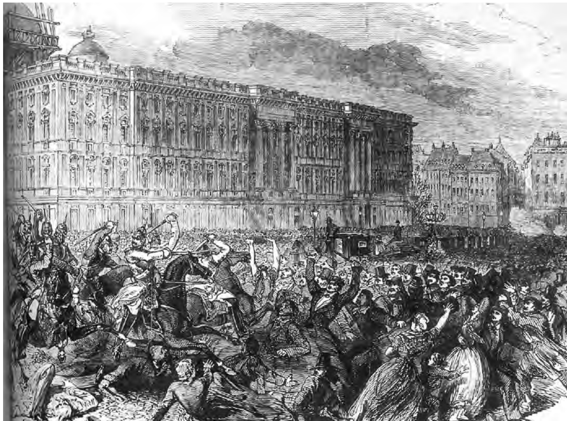
A contemporary engraving of events in Berlin, 1848.