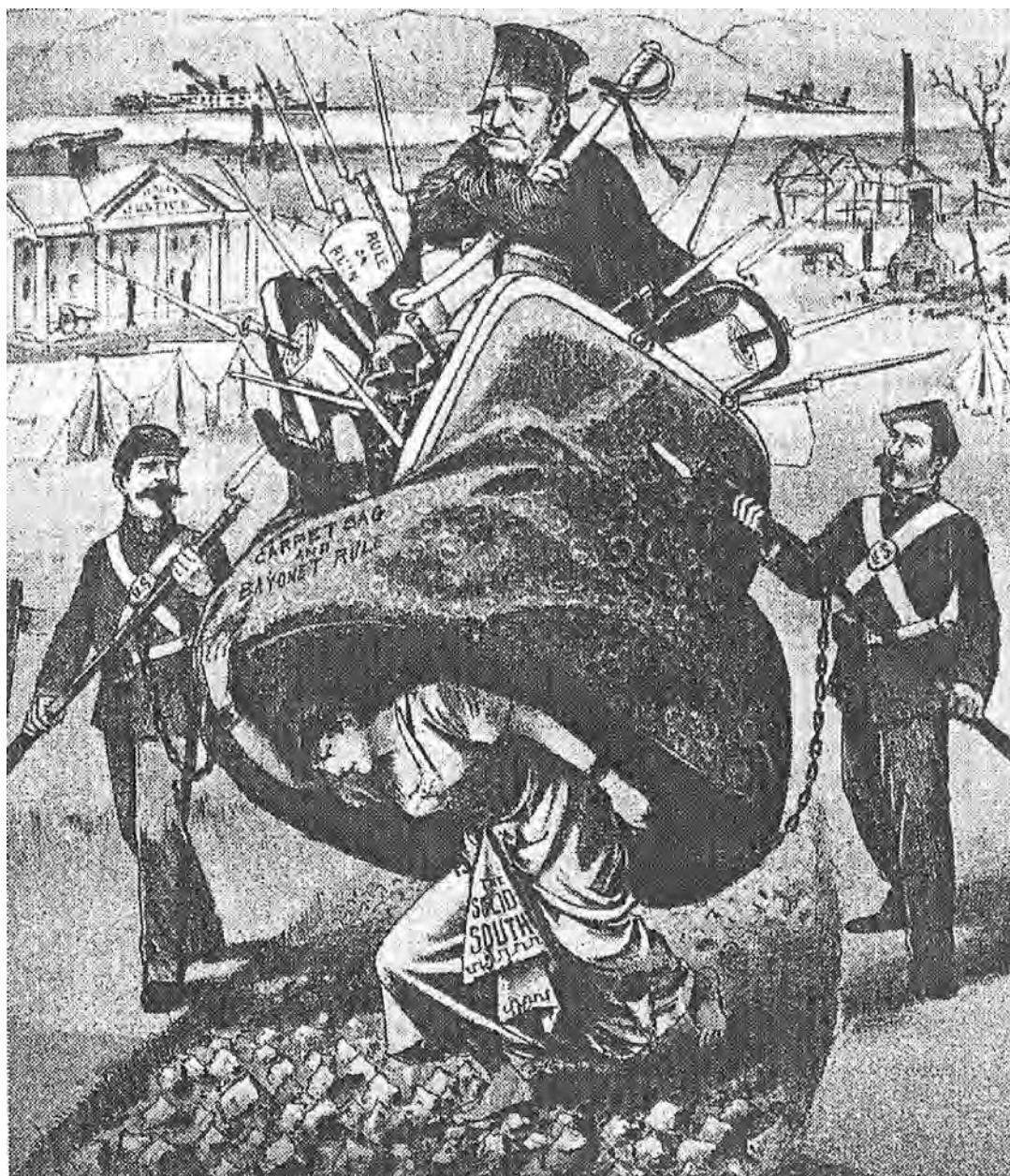
A cartoon published in 1880 showing 'carpetbagging' oppressing the South.