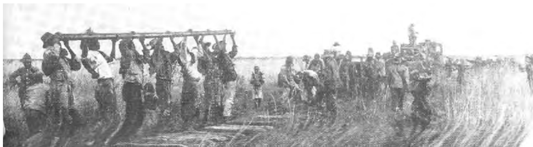
A photograph showing the construction of the Otavi Railway across Herero land in 1903.

19 Look at the photograph, and then answer the questions which follow.